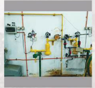
LRA Lubuk Merbau