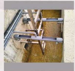
LRA Sungai Semantan