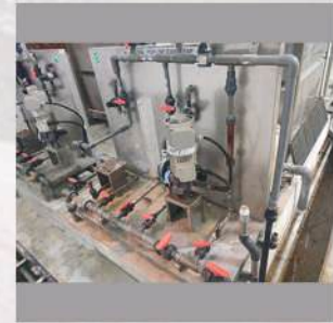
LRA Sungai Klau