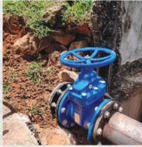
LRA Bukit Tampoi AIS

Discover the projects and services that define Aqua Oleo. Our gallery highlights completed works, system installations, and on-site solutions that demonstrate our commitment to quality, reliability, and innovation. Each image reflects the trust clients place in us to deliver results that last.